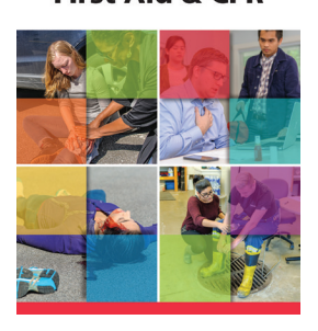
First Aid & CPR